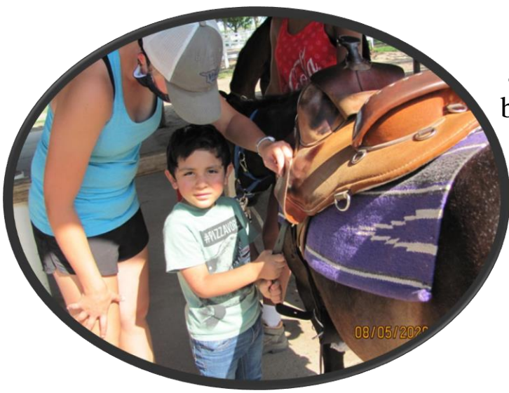
Tighten the cinch and grab Freddy's bridle off her hook.