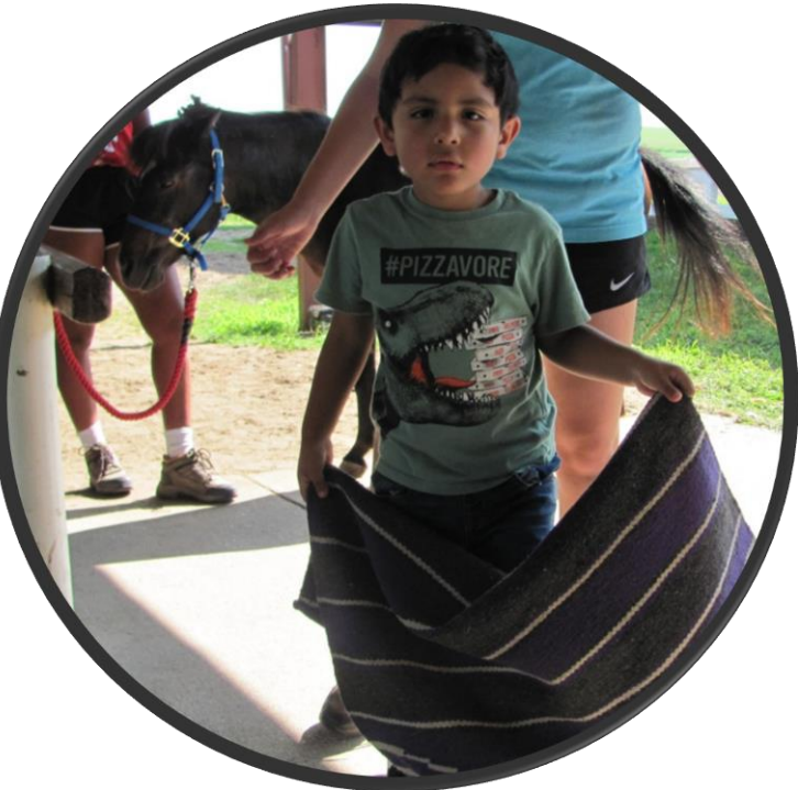
Now, it's time to put everything away, just when I was getting the hang of it.