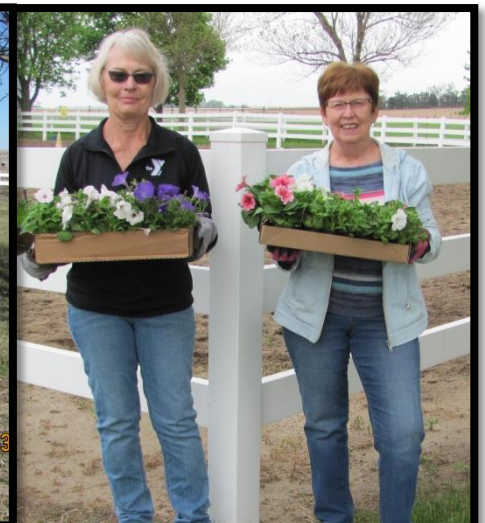
Christ Lutheran Priscillas