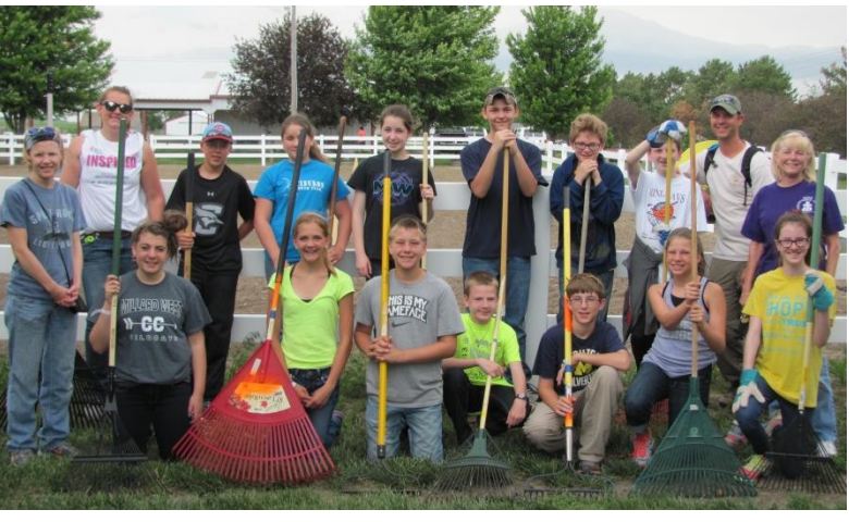
Norfolk Methodist Church